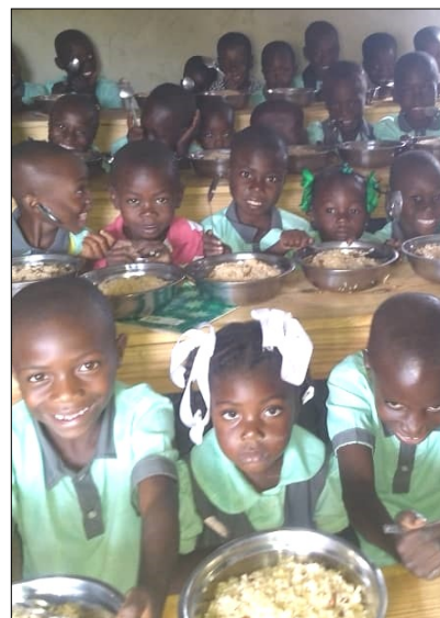
Daily hot meals put smiles on Marre Blanche students' faces