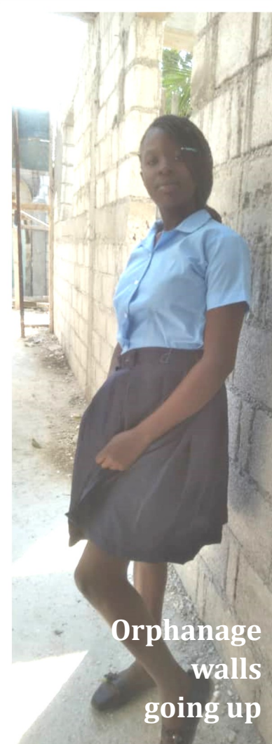
Orphanage walls going up