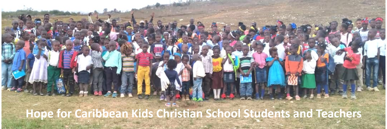
Hope for Caribbean Kids Christian School Students and Teachers