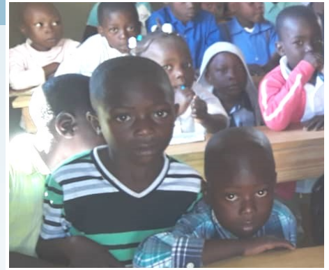
Students at Hope for Caribbean Kids Christian School are about to begin their school day.